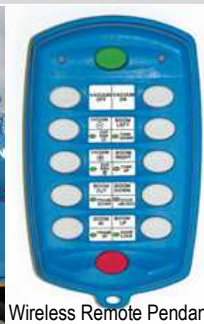
Wireless Remote Pendant