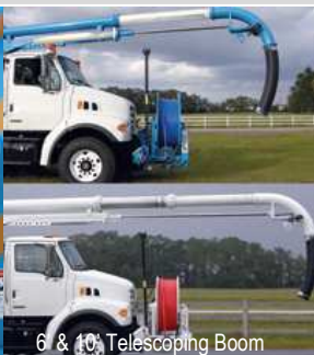
6 & 40 Telescoping Boom