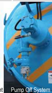
Pump Off System