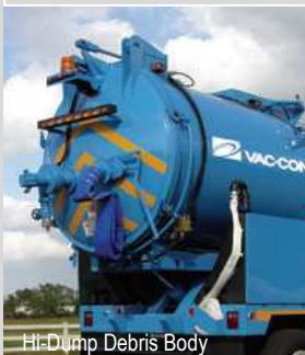
Hi-Dump Debris Body

tank door is securely fastened by hydraulic door locks and is controlled from the side of the truck for optimum safety and... it's backed by a five-year warranty.